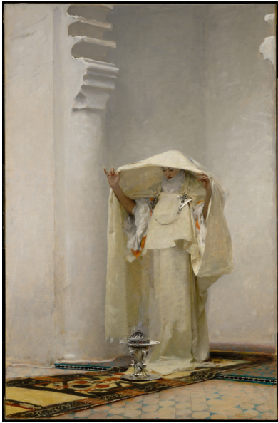
John Singer Sargent, Fumée d'ambre gris ( Smoke of Ambergris ), 1880. Oil on canvas. Acquired by Sterling and Francine Clark, 1914. 1955.15.

John Singer Sargent made Fumée d'ambre gris ( Smoke of Ambergris ) after traveling to North Africa in 1879. The painting combines details inspired by different places and people he observed, so though Western audiences interpreted the resulting image as a realistic view of North Africa, it is actually a made up scene. In addition to this painting being an imaginary scene, it is also an experiment with a specific color: white. Sargent combined different colors with white paint to create many shades and tints. This allowed him to delineate shadows and highlights—even with a limited color palette!